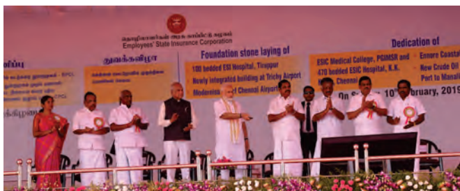
Hon'ble Prime Minister unveiling the foundation stone through remote control

The ESIC Medical College & PGIMSR, K.K. Nagar, Chennai offers MBBS course with an annual intake of 100 seats and 14 seats for MD/MS courses. Constructed in a sprawling area of nearly 20 acres with a project cost of ₹382.50 crores, the 470 bedded hospital associated with the Medical College has all state-of-the-art medical equipments and facilities and provides treatment in all disciplines of medicine.