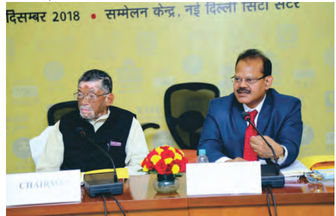
आयोजित बैठक का दृश्य