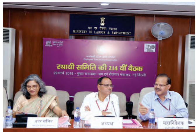
DG, ESIC addressing the participants

ROs/SROs, Hospitals and Medical Colleges spread across the country.