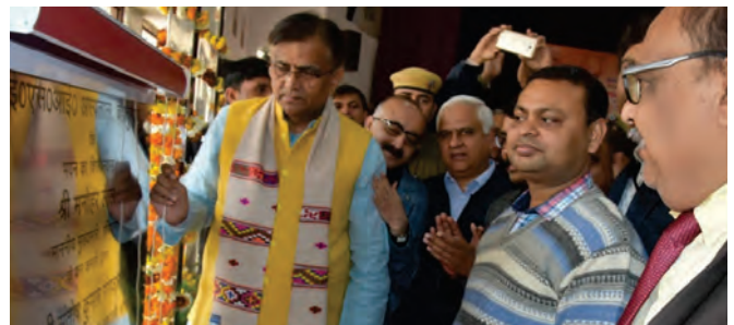
A view of unveiling the foundation stone

The proposed 100 bedded ESI Hospitals, Bahadurgarh & Bawal will be constructed with a project cost of ₹70 crores each. The hospitals will have OPD, Casualty, Wards, Emergency, Pharmacy, Labs, OT Block and many more facilities.