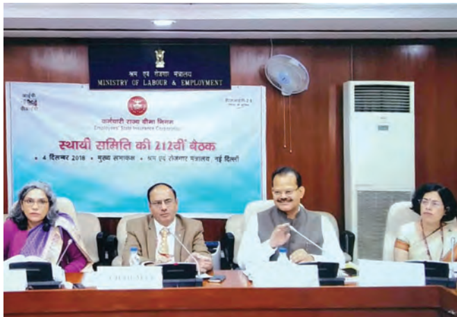
DG, ESIC welcoming the members of Standing Committee efficient delivery of services to the IPs.

Director General, ESIC welcomed all the participants in the meeting. In his welcome address, DG, ESIC apprised the members that this meeting has been held mainly for seeking approval of the Audited Annual Account and Annual Report of ESIC for the year 2017-18. He also advised to go in an aggressive mode to provide better services to the IPs so that they should feel the difference in getting better facilities compared to other hospitals. He also said that if required, more power may be delegated at regional level for