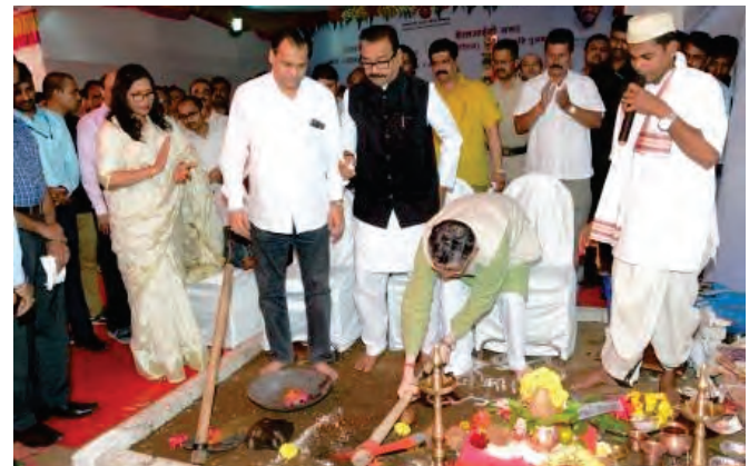
Shri Santosh Kumar Gangwar, Hon'ble Union Minister of State (I/c) for Labour & Employment performing Bhoomi Poojan

Shri Gajanan Kirtikar, Hon'ble Member of Parliament, Mumabi (North-West) in his address appreciated the efforts of ESIC.