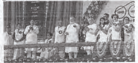
College and 510-bedded Hospital, Faridabad (Haryana) will provide medical facilities to the workers and their family members of the region. The workers will be benefited by these facilities.

Prime Minister Narendra Modi dedicated ESIC Medical College and 510-bedded Hospital, Faridabad to the nation alongwith the basket of different projects at Kurukshetra, Haryana. The other dignitaries to grace the occasion were Satyadev Narayan Arya, Governor, Haryana; Manohar Lal Khattar, Chief Minister, Haryana; Sushri Uma Bharti, Minister of Drinking Water and Sanitation, Govt of India; and Kavita Jain, Minister of Industry, Govt of Haryana. During his address, PM Modi said the ESIC Medical