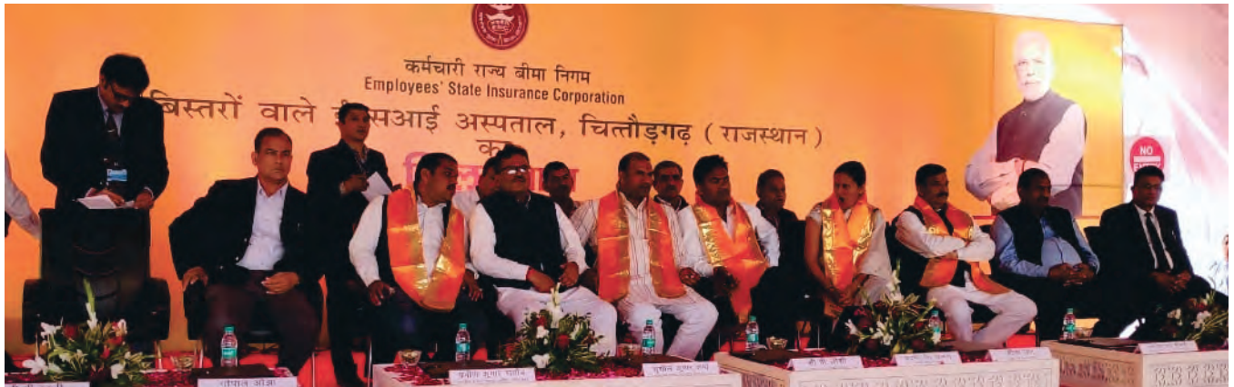
A views of the dignitaries present on the dais

The 30 bedded ESI Hospital, Chittorgarh will be equipped with facilities such as OPD, Casualty, Pharmacy, Labs, OT etc. an will be run exclusively for the benefit of Insured Persons and their family members covered under ESI Scheme.