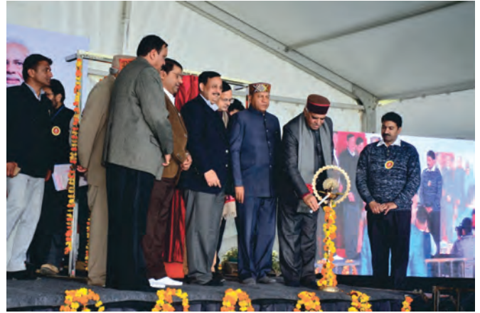
शिलान्यास समारोह के दौरान दीप प्रज्वलित करने का दृश्य

काला अंब में बनाए जाने वाले इस 30 बिस्तरों वाले ईएसआई अस्पताल को बाद में 100 बिस्तरों वाले अस्पताल में विस्तार किया जाएगा। लगभग 16.11 बीघा भूमि में बनाए जाने वाले इस अस्पताल में ओपीडी वार्ड, लैबोरेट्री, ऑपरेशन थिएटर एवं मातृत्व सेवाएं जैसी आधारभूत सुविधा उपलब्ध होंगी जिससे सिरमौर में कर्मचारी राज्य बीमा योजना के अंतर्गत व्याप्त 35,000 बीमित व्यक्ति एवं 1,00,000 से अधिक आश्रितजन लाभान्वित होंगे। यह अस्पताल जिला सिरमौर के अंतर्गत आने वाले सभी इलाकों के ईएसआई योजना के बीमितों और उनके परिवार के सदस्यों की स्वास्थ्य देखभाल की दिशा में एक अहम कदम साबित होगा।