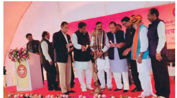
Lighting of the lamp on the occasion by the Dignitaries

The 100 bedded ESIC Hospital; Udaipur is equipped with inpatient and outpatient departments and will provide treatment facilities through various departments. This hospital is equipped with facilities such as OPD, IPD, ICU, NICU, Wards, emergency, OT, modern path laboratories & diagnostic services, pharmacy etc.