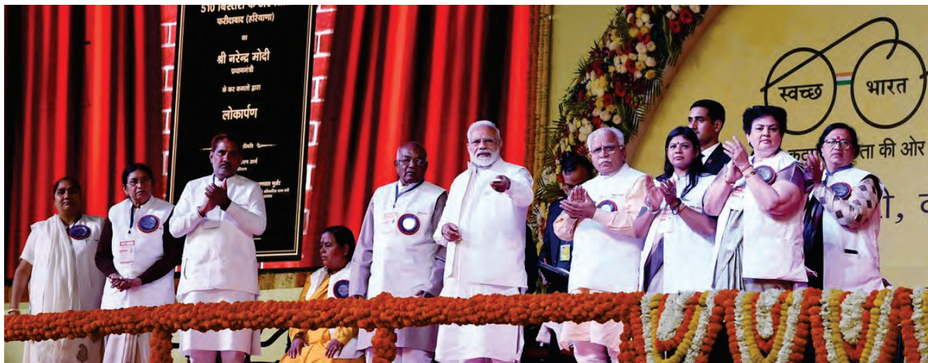
Hon'ble Prime Minister dedicating the Medical College & Hospital through remote control

The Hon'ble Prime Minister in his speech said that the 500 bedded ESIC Medical College & Hospital will provide medical facilities to the Insured Persons and their family members residing in Haryana. He also said that the Central Govt. is working to provide good quality medical care to every citizen of India and for this purpose, Wellness Health Centres are also being opened under 'Ayushman Bharat Yojana' to