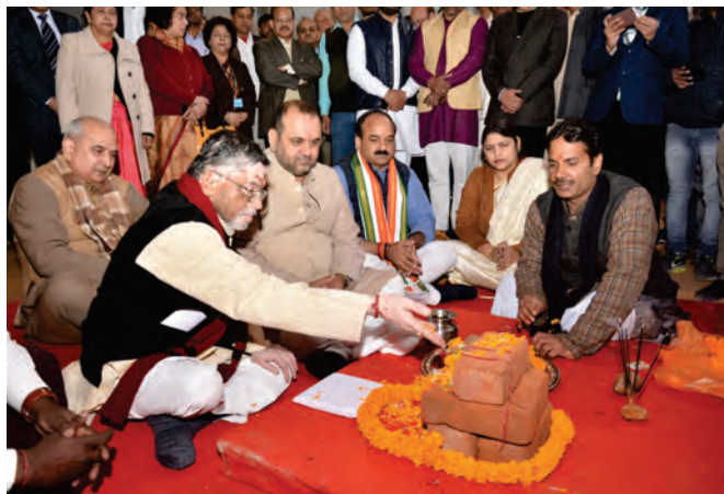
Shri Santosh Kumar Gangwar, Hon'ble Union Minister of State (I/c) for Labour & Employment performing Puja during foundation stone laying for Mayur Vihar Dispensary

Dr. Mahesh Sharma, the then Hon'ble Minister of State (Independent Charge) for Culture and Environment, Forest & Climate Change, Govt. of India thanked Shri Santosh Kumar Gangwar and welcomed the opening of new ESIC dispensaries at Phase-II, Noida and Sector - 22, Noida. The Minister also assured to look into the demand of constructing a new dispensary in Greater Noida area.