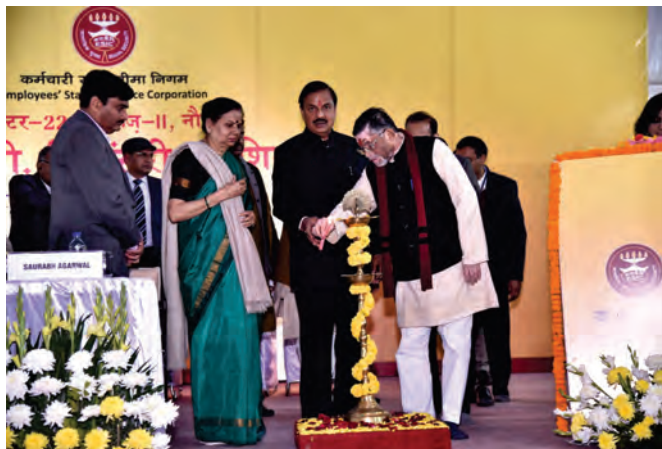
Shri Santosh Kumar Gangwar, Hon'ble Union Minister of State (I/c) for Labour & Employment lighting the lamp on the occasion of foundation stone laying of Noida Dispensary