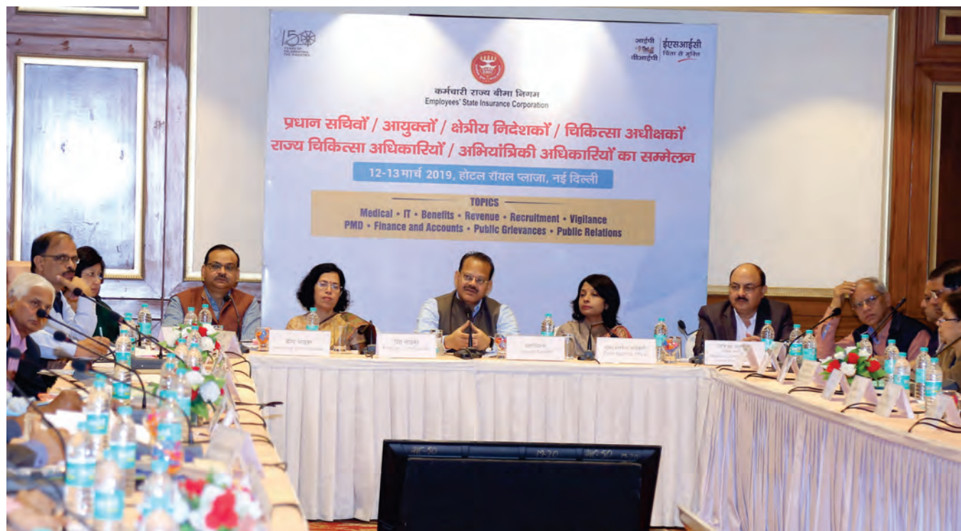
A view of the Meeting in progress

After long deliberations on various agenda points for two days, the meeting ended with a vote of thanks to the Chair.