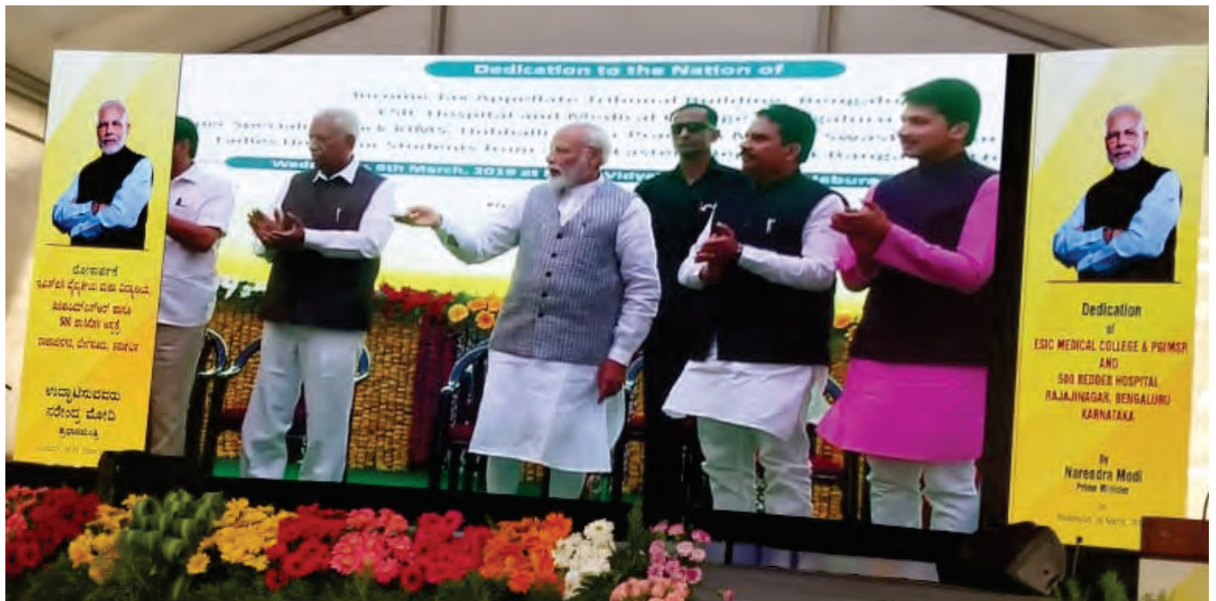
Shri Narendra Modi, Hon'ble Prime Minister dedicating the Medical College & PGIMSR and 500 bedded Hospital

The ESIC Medical College & Hospital has been constructed with a project cost of ₹540 Crores (approx.) in a sprawling area of 19 Acres. The college has an annual intake of 100 seats for MBBS and 55 PG seats. The Medical College has all the modern educational infrastructure viz., AC Classrooms, Labs & Modern equipments to provide quality medical education. The Hospital associated with this Medical College is equipped with state-of-the-art equipments and provides medical services in all specialities such as, casualty/emergency, OPDs, wards, Modular OTs, ICUs, MRI & CT Scan, etc.