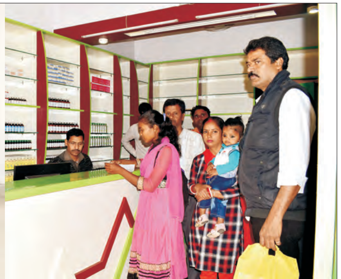
Dispensary-cum-Branch Office, Ghatshila (Jharkhand)

DCBO in all the districts falling under their jurisdiction immediately, so that the target can be achieved.