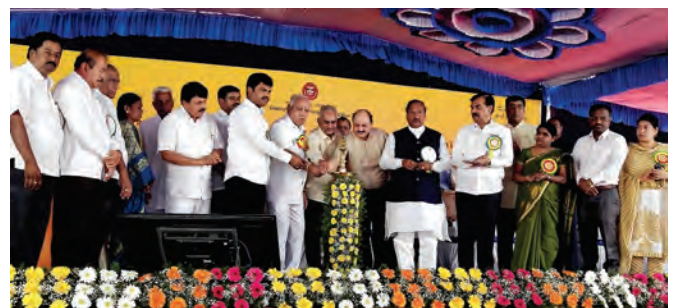
Lighting of the lamp on the occasion by the Dignitaries