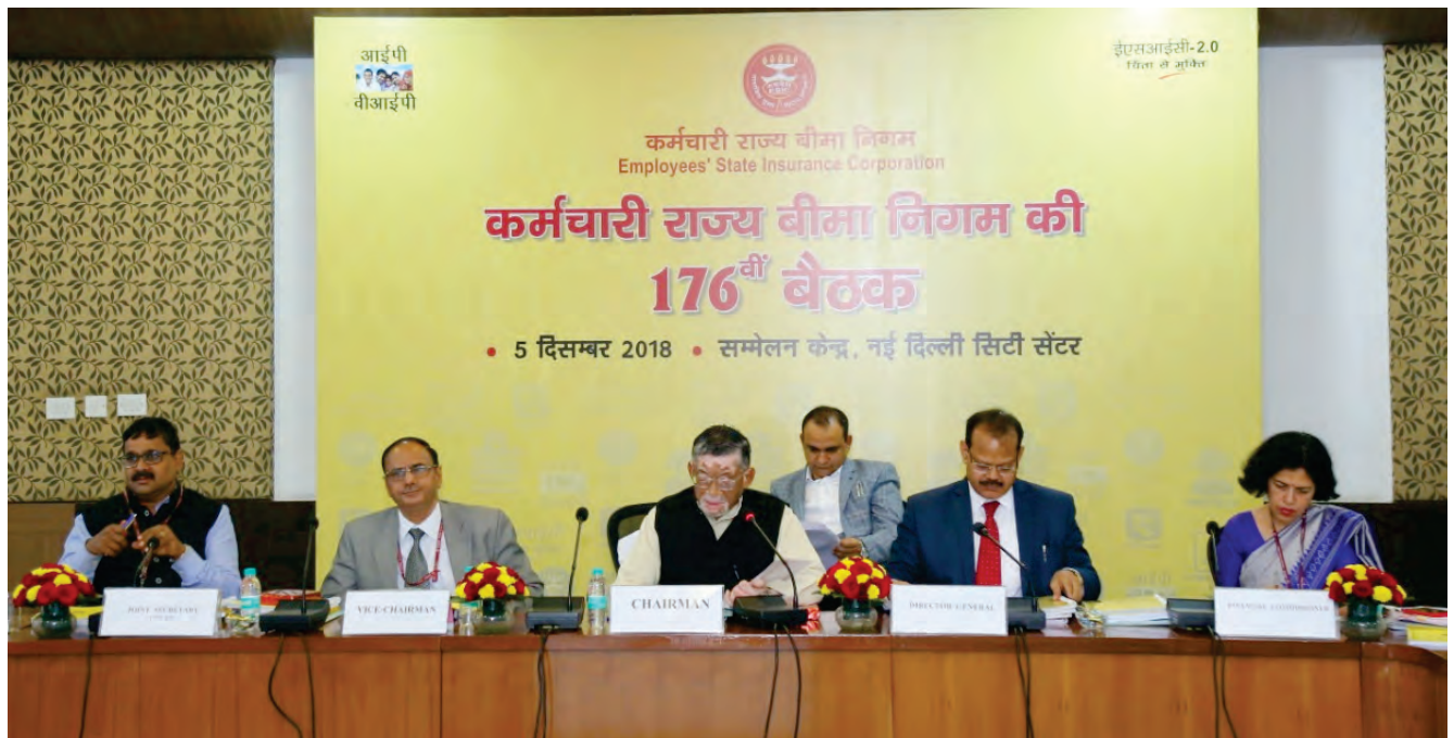
Shri Santosh Kumar Gangwar, Hon'ble Union Minister of State (I/c) for Labour & Employment and Chariman, ESIC addressing the 176 th meeting of ESIC.

The meeting ended with vote of thanks to the chair.