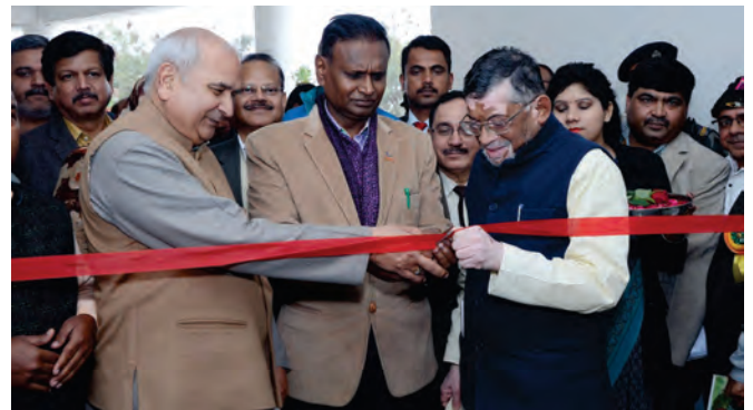
Shri Santosh Kumar Gangwar, Hon'ble Union Minister of State (I/c) for Labour & Employment inaugurating the OPD Wing by cutting the ribbon

Dr. Udit Raj, the then Hon'ble Member of Parliament, Lok Sabha also addressed the gathering and thanked Shri Gangwar for this hospital.