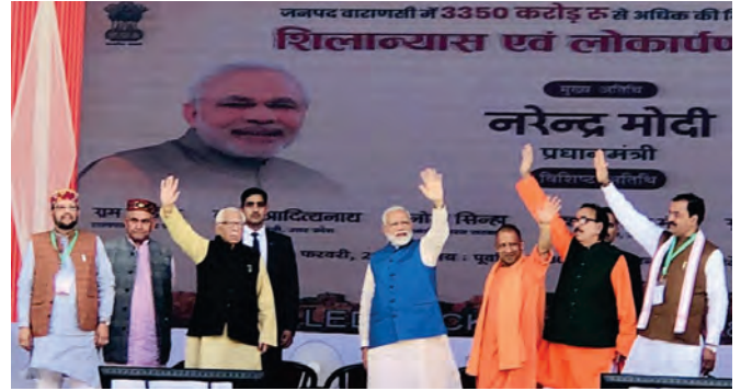
Hon'ble Prime Minister and other dignitaries cheering the crowd during the dedication ceremony

The Hospital has latest facilities such as OPD, IPD, Emergency Wards, Diagnostic Services, and Operation Theatres. This hospital will also have an additional 50 bedded Super Speciality department having services such as Cardiology, Neurology, Medical Oncology, Nephrology & Urology.