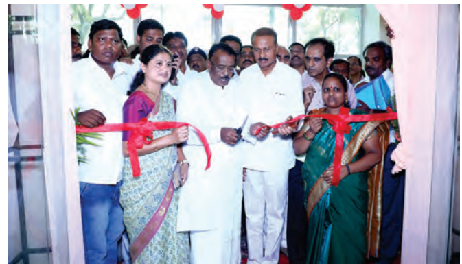
Shri Venkataramanappa, the then Hon'ble Minister inaugurating the Dispensary and Diagnostic Centre

Constructed with a project cost of ₹8.65 Crore (approx.) in a sprawling area of 3500 Sq.mtr. the ESIC Dispensary & Diagnostic Centre, Nanjangud is equipped with facilities such as OPD Rooms, Pharmacy, Labs, Minor OT and many more facilities.