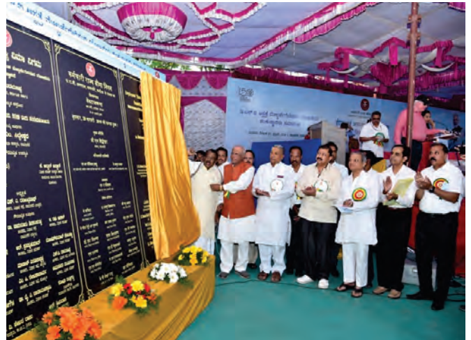
Unveiling of the plaque of Foundation Stone by the Chief Guest

Based on the increase of IPs and keeping in view the interest of the beneficiaries, ESIC is upgrading the facilities of ESI Hospital, Davangere by increasing the bed strength from 50 beds to 100 beds. The hospital is being upgraded with an estimated cost of ₹ 25 crore and the facilities to be added are Inpatient Department, Wards (additional 50 beds) & Operation Theatre., Medical Gas Pipeline (MGPS), Fire fighting works, High Voltage Alternating Current (HVAC), Lifts, Kitchen, and Laundry etc.