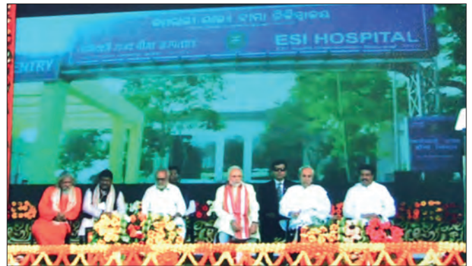
Hon'ble Prime Minister along with other dignitaries on the dais

The other projects inaugurated / foundation stone laid during the event were of Ministry of Road Transport & Highways, Ministry of Human Resource Development, Ministry of Petroleum & Natural Gas, Govt. of India, etc.