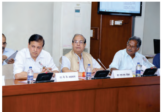
Snapshots of the Meeting in Progress